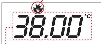
Set Water Temperature

There are three possible items that can be displayed in the large digits: (1) Actual Water Temperature [W.TMP]; (2) Set Temperature [S.TMP]*; (3) Time Clock [TIME]. Each display mode has a unique icon shown at the top of the screen to indicate the current item being viewed (refer below).