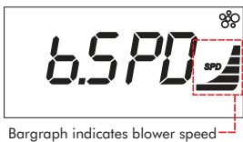
Bargraph indicates blower speed